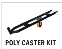
POLY CASTER KIT